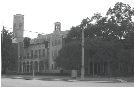
2. Hendry County Courthouse