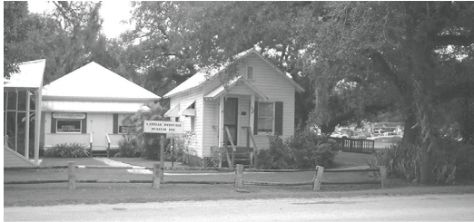
1. Labelle Heritage Museum