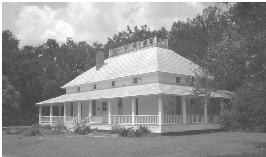
3. Captain Hendry House